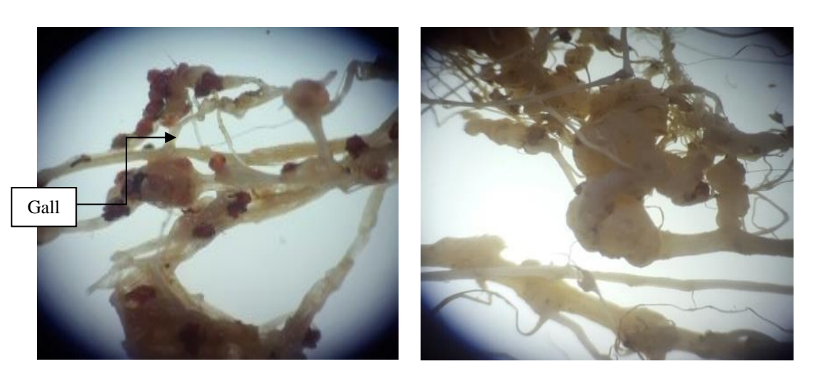
Figure 2. Effect of different inoculum levels of eggs on some infection criteria in cucumber plants. A. Signs of root-knot disease on roots. B. Symptoms of root-knot disease on roots